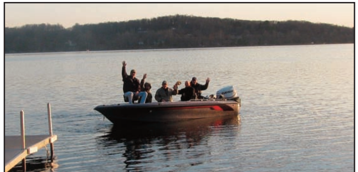
Fishermen On the Opener